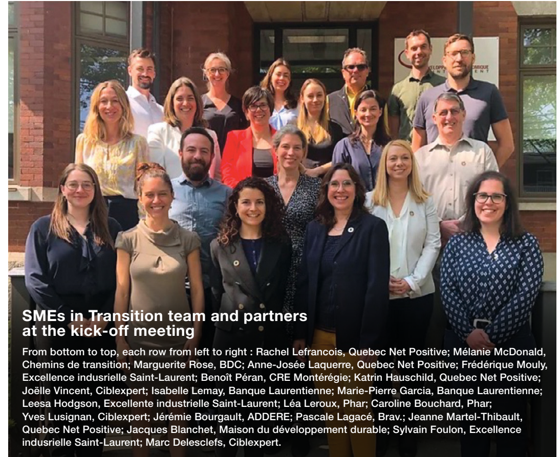
SMEs in Transition team and partners at the kick-off meeting